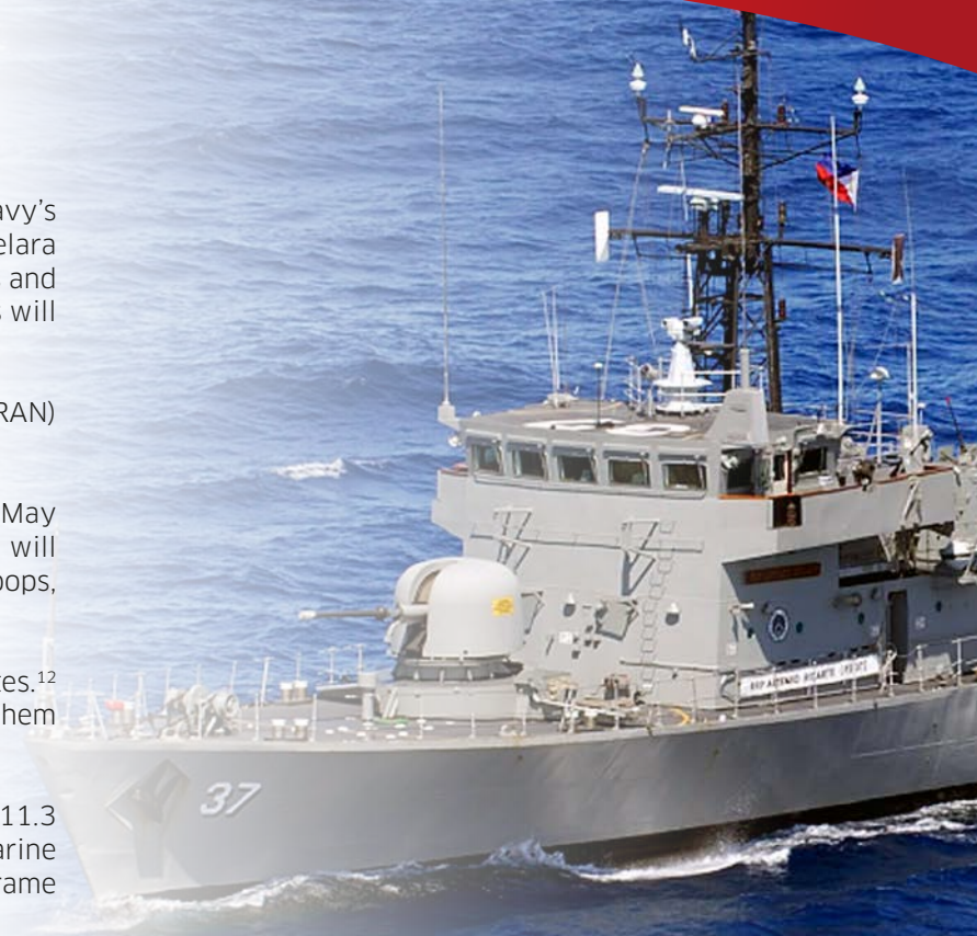
Caption: The Republic of Philippines Tatlong Bayany-class corvette BRP Artemio Ricarte (PS-37).

On the 2nd February 2016, the DND posted a Supplemental Bid Bulletin (SBB), informing bidders of changes in the bidding documents of the PN's Frigate Acquisition Program. This updated tender, originally issued in 2013, now contains more specific details of the PN needs. The SBB states that the multi-mission frigates should have a length of at least 92 meters long, a displacement of at least 2000 tons and be able to survive at sea state 7. The frigates must be able to accommodate 12-ton helicopter units at flight deck, and have a hangar for a 10-ton helicopter. 13 Bids will be accepted from 3rd March onwards. 15